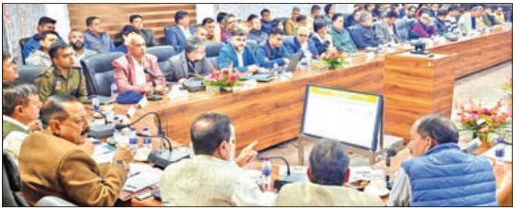
Union Minister Dr. Jitendra Singh chairing the District Development Coordination and Monitoring Committee Meeting (DISHA) at Kathua on Saturday.

Addressing the meeting, Dr Jitendra directed the officials to ensure implementation of schemes related to water,