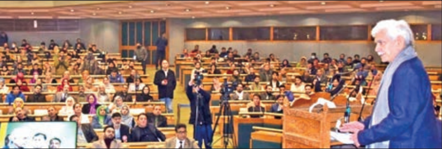
Lieutenant Governor Manoj Sinha speaking at the Valedictory Ceremony of SKIMS Annual Festival Week in Srinagar.

'500 MBBS seats created in almost 7 decades; we created 800 additional seats within 4 years'