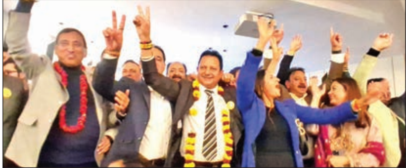
Newly elected Executive Committee members of Amar Singh Club Jammu in a jubilant mood.