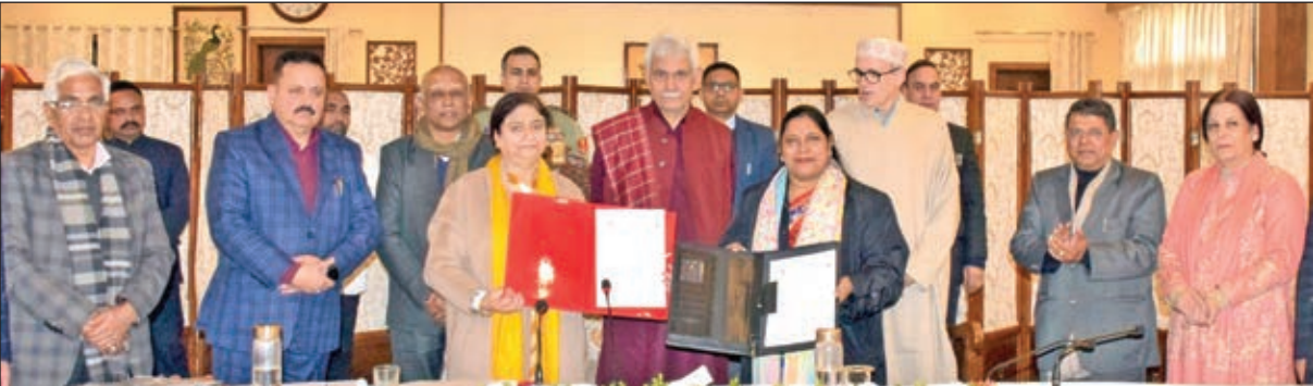
KU and Siddharth University, Uttar Pradesh representatives signing MoU in presence of Lt Governor Manoj Sinha.

The University Council accorded in-principle approval to several key academic and administrative agenda items. These included the adoption of a revised Policy Mechanism for Admission of Foreign National (International) Students, the change of nomenclature of the Department of Earth Sciences to the Department of Geology, and the introduction of Five-Year Integrated Master's Programmes (FYIMP) in Applied Geology, Tourism and Travel Management, Data Science and Artificial