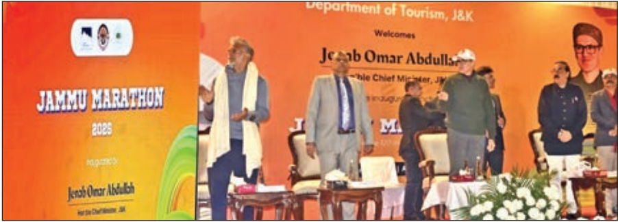
CM Omar Abdullah unveiling official logo of Jammu Marathon on Monday.