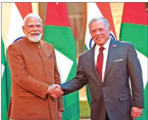
PM Narendra Modi receives warm welcome by King of Jordan Abdullah II bin Al Hussein at the Hussein Palace on Monday.

The two sides agreed to further deepen their partnership, especially in the fields of trade and investment, defence and security, counter-terrorism