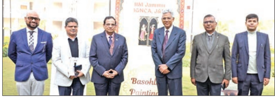
Dr. Vinod K. Paul, Member, NITI Aayog with IIM Jammu faculty at a programme.