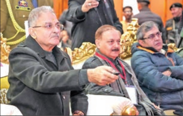
LG Ladakh, Kavinder Gupta unveiling logo of Destination Ladakh.

He emphasized that Ladakh's unique heritage, pristine natural landscape and resilient communities form the core of its global identity, and the UT Administration is committed to promoting tourism that is inclusive, balanced and respectful of local traditions and ecology. The Lt Governor was speaking at a programme organised by the Department of Tourism for the unveiling of the Destination Ladakh logo. He said the new tourism identity reflects Ladakh's distinctive character and long-term vision for responsible