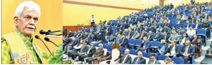
LG Manoj Sinha addressing UT Level Conference in Jammu on Thursday.

JAMMU: Lieutenant Governor Manoj Sinha chaired the UT Level Conference on the lines of DGPs/IGPs conference in Jammu on Thursday. In his address, the Lieutenant Governor said that under the leadership of Prime Minister Narendra Modi and Union Home Minister Amit Shah, the UT level security conference will serve as the hub for deliberation and collaboration to develop a whole of government approach to counter terrorism in all its form. He also observed that during DGPs/IGPs conference in Raipur this year, threadbare discussions were held on the theme 'Viksit Bharat: Security Dimensions', which reflects GoI's commit-