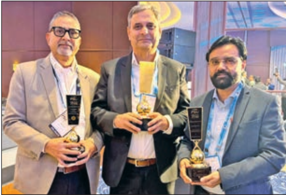
Jammu Smart City Limited officers after receiving awards.