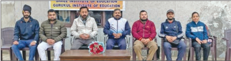
SVSC members with officials at the Dashmesh Kabaddi Competition.

■ STATE TIMES NEWS JAMMU: The Swami Vivekanand Sports Club organized the Dashmesh Kabaddi Competition from December 20 to 21, 2025, at Ved Mandir Ground, Ambphala, Jammu. The two-day sporting event witnessed enthusiastic participation from 22 teams representing Jammu, Doda, Bhaderwah, Ramban, Kathua, Akhmoor, and Samba districts. The competition was held in three categories: Under-14, Under-17, and Under-19, along with a