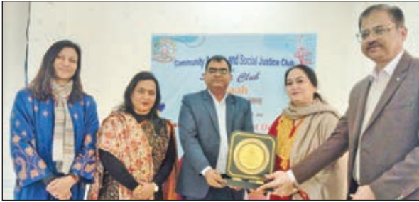
JU faculty felicitating a dignitary.