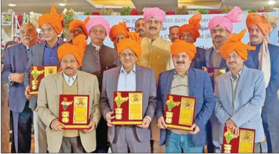
Mahajan Sabha Channi Himmat members with MP Jugal Kishore Sharma.