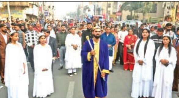
Christmas procession being taken out in Jammu.

designed tableaux depicting angels and King Herod-the Roman ruler during the time of Jesus Christ-along with church choirs, were the major attractions of the rally. Choirs from various churches of Jammu city sang melodious worship songs related to the birth of Lord Jesus Christ, creating a festive and spiritual atmosphere throughout the route. People from different communities appreciated the presentation of the tableaux and warmly welcomed the procession.