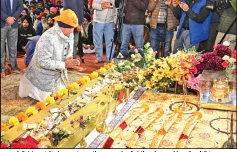
LG Manoj Sinha paying tributes to the Sahibzadas on Veer Baal Diwas in Jammu on Friday.