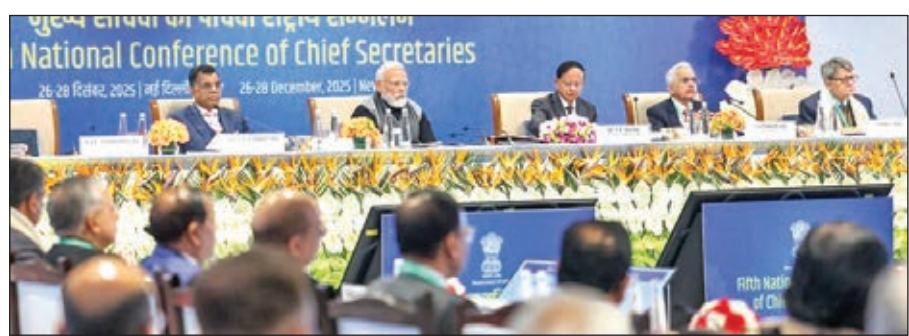
PM Narendra Modi chairing national conference of chief secretaries at New Delhi.