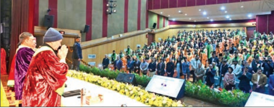
LG Manoj Sinha at the 11th Convocation Ceremony of Shri Mata Vaishno Devi University at Kakryal on Saturday.

■ STATE TIMES NEWS JAMMU: The Lieutenant Governor, Manoj Sinha, graced the 11th Convocation Ceremony of Shri Mata Vaishno Devi University, on Saturday.