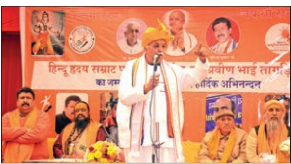
Former VHP leader Praveen Togadia speaking at an event in Jammu on Saturday.

Talking to reporters on the sidelines of a Rashtriya