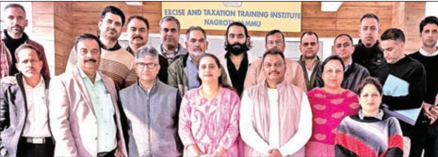
LMD J&K officials at training programme.