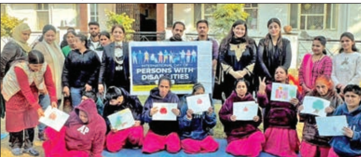
DLSA Jammu members with inmates of Muskan Home.