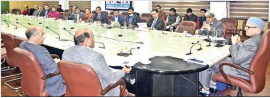
Chief Minister, Omar Abdullah chairing a review meeting of Mission YUVA.

He underlined that although the Mission is still in its early operational phase, the results are encouraging. "We have been discussing this for some time. The actual operational duration of these schemes is barely a few months, and in any scheme, that is a very short life