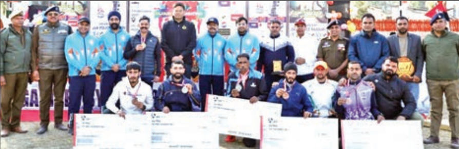
Winners of Half Marathon 2025 posing with dignitaries.