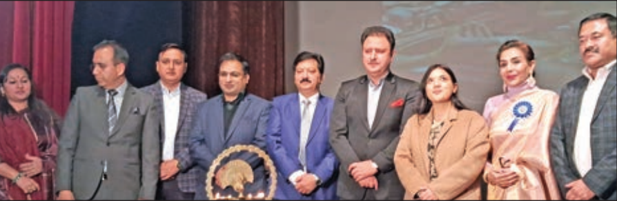
Dignitaries with BIS faculty at Annual Day function.

■ STATE TIMES NEWS JAMMU: British International School celebrated its Annual Day 2025 with great splendour and enthusiasm at the Police Auditorium, Jammu. The event, themed "Rhythms of India - Where Every Step Tells a Story," showcased the cultural vibrancy of the nation through a series of colourful and dynamic student performances that left the audience enthralled. The ceremony was graced by several distinguished guests. Chief Guest Ms.