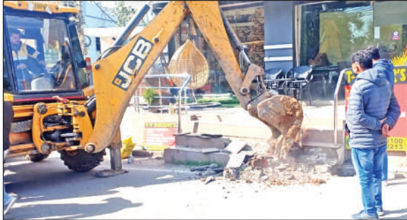
JMC carrying out anti-encroachment drive.

The drive was conducted on receiving a number of complaints from the residents of the twin localities about encroachment of the roads and lanes by the shopkeepers and residents