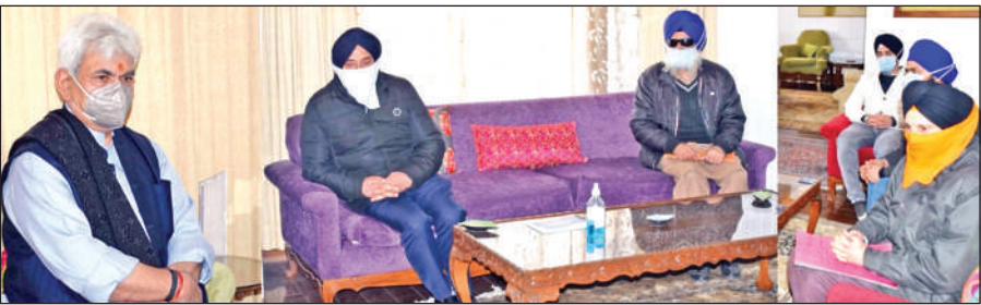
Delegation of Sikh community calling on Lieutenant Governor, Manoj Sinha.

The Lt Governor while interacting with the members of the delegation assured them that their demands