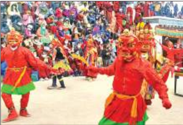
Mask dance at Spituk Gonpa.

LEH: Spituk Gustor- a two-day historic monastic festival- concluded on Monday at Spituk Gonpa.