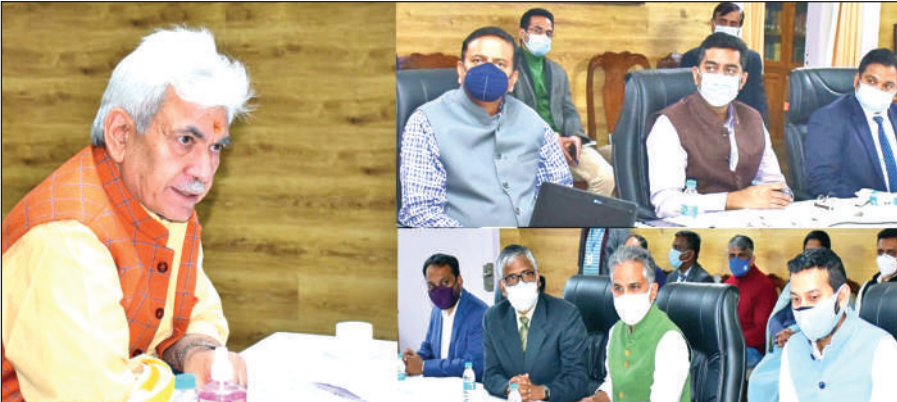
LG Manoj Sinha during launch of J&K Govt and OYO Group's rural home-stay under project Crown of Incredible India.