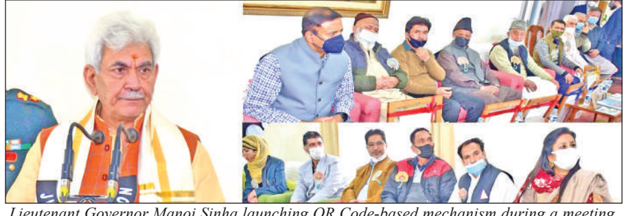
Lieutenant Governor Manoj Sinha launching QR Code-based mechanism during a meeting.

With the help of modern technology, we will be able to standardize uniqueness of handmade carpets & boost exports of J&K's carpet industry in the international market, he added. On the occasion, the Lt Governor also felicitated UT's awardees of Handicrafts & Handloom. "I truly admire the painstaking work of all the craftsman and carpet weavers. Government is providing training & financial support to strengthen the priceless artistic and cultural heritage of J&K UT", he said.