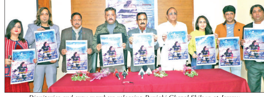
Dignitaries and crew members releasing Punjabi Ghazal Shikwa at Jammu.