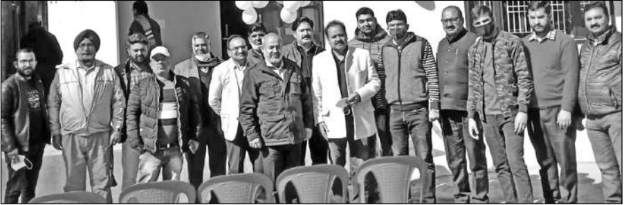
Officials and others during inauguration of new building.