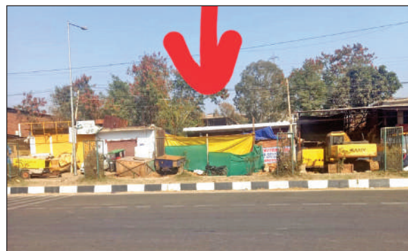
Illegal construction on Government land by ex-minister Abdul Majeed Wani in Jammu.

The videos and pictures going viral on the social media show the work being carried out behind the green construction safety nets at the most busy road of the