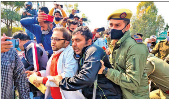
Police detaining protesting dental doctors at Jammu.

He said thousands of dental doctors are unemployed across the Union Territory and more than 500 of them have already crossed the age