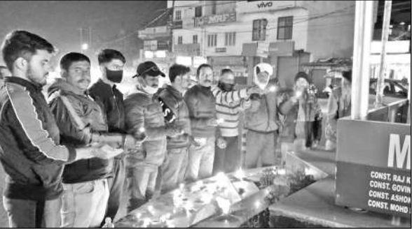
AIF members paying tributes to Pulwama martyrs.

■ STATE TIMES NEWS UDHAMPUR: In order pay heartfelt tributes to Pulwama Martyrs, a large number of volunteers of Aware India Foundation