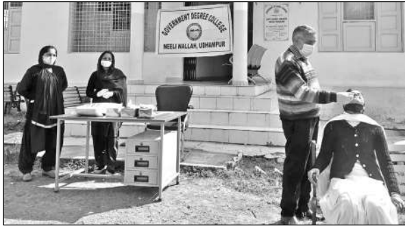
Students being tested for COVID.