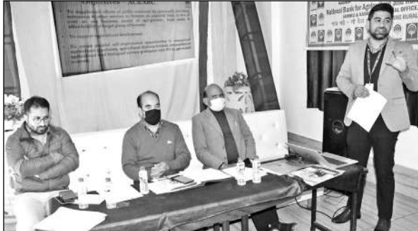
A resource person expressing views during the programme.