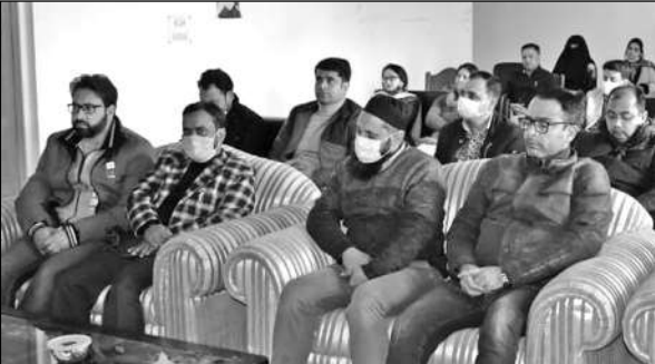
A section of dignitaries during the programme.