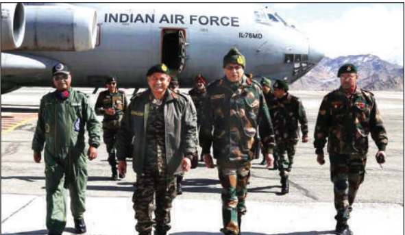
Northern Army commander Lt Gen Upendra Dwivedi on his arrival at Leh.

■ STATE TIMES NEWS LEH: Northern Army commander Lt Gen Upendra Dwivedi on Saturday reached Leh on his four-day maiden visit to the Union Territory of Ladakh after taking over as the general officer commanding-in-chief (GOC-in-C) of the Udhampur-based command this month, a spokesperson