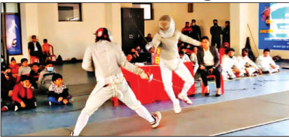
Fencers competing in selection trials.