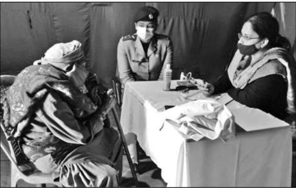
Doctor examining a patient during the camp.

■ STATE TIMES NEWS DUDU/BASANTGARH: Army conducted a medical cum veterinary camp