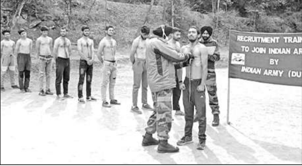
Army official taking chest measurement of a youth.

■ STATE TIMES NEWS KISHTWAR: Pre-Recruitment training was conducted by the Indian Army in Malar region of Kishtwar district (J&K) to train the youth for the various upcoming recruitment rallies for Indian Army, Para Military Forces and J&K Police. The candidates were imparted training on physical and theoretical aspects required for enrollment into the Security Forces. The training schedule included activities such as running practice, long jump, pull ups practice, running and zigzag balance practice. In addition to this, the