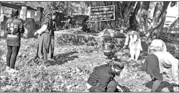
Students carrying out cleanliness drive.