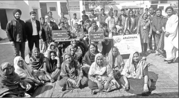
NGO members along with women during the camp.

■ STATE TIMES NEWS SAMBA: Aradhana-a ray of hope, an NGO working for child education & societal welfare organised a legal awareness program in cooperation with District Legal Services Authorities (DLSA) Jammu in Govt. Middle School Dabuj Village, Jakh to spread light on women empowerment and women