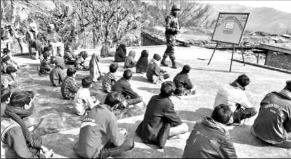
Youth participating in a programme.