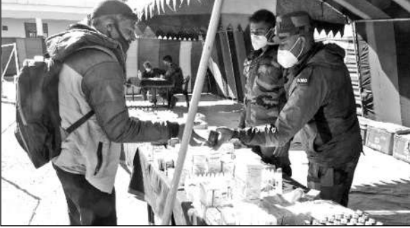
Army official providing medicines.