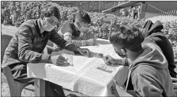
Students participating in painting competition.

KISHTWAR: Army in its continuous efforts to motivate the youth of the Nation has undertaken a variety of programmes. In continuing with the same spirit, Indian Army organised a Painting Competition at Thatri in District Kishtwar. A lot of students from class 2nd to 8th participated in the event with immeasurable joy, happiness and competitive spirit. The students