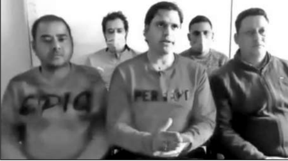
JKTMA members addressing a meeting.