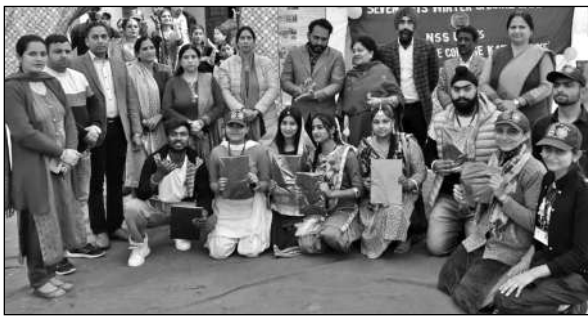
NSS volunteers along with faculty and others during the event.