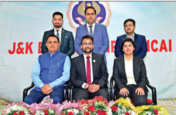
Newly elected Managing Committee of J&K Branch of ICAI posing for photograph.