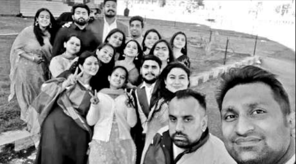
Guidance and Counselling Cell For Youth Development members after celebrating annual day.