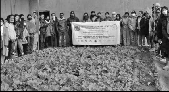
Participants of Science Festival in Leh.