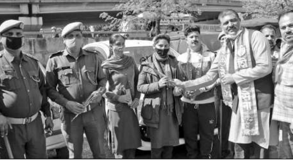
Shiv Sena J&K unit felicitating police personnel.

Speaking on the occasion, Sahni said that the main aim of launching this campaign is to show the human face of the police personnel who are serving day and