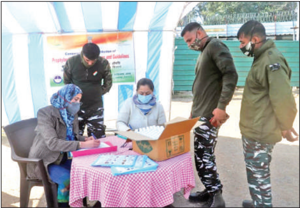
Doctors examining CRPF personnel during a camp.