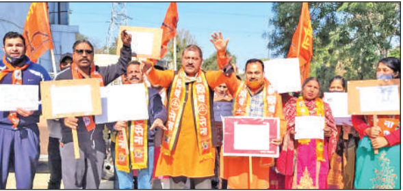
Shiv Sena activists raising slogans during a protest.