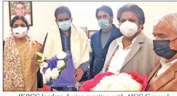
JKPCC leaders during meeting with AICC General Secretary Organization K C Venugopal (MP).