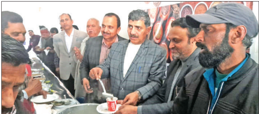
Member Parliament, Jugul Kishore Sharma serving products made by Millet among participants.