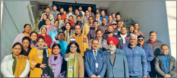
Teaching fraternity after conclusion of training programme.