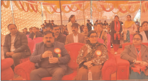
GHSS Gajansoo celebrating annual day.