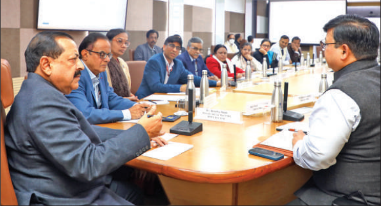
Union Minister Dr. Jitendra Singh convening the monthly joint meeting of different Science Ministries and Departments at the Science Centre, New Delhi on Sunday.

■ STATE TIMES NEWS NEW DELHI: Union Minister for Science & Technology, Dr Jitendra Singh on Sunday convened the monthly joint meeting of different Science Ministries and Departments at the Science Centre here, wherein among other agenda items, he reviewed the Space Hackathon held last month for the students to sharpen their skills and innovation. The 30-hour hackathon on Space related challenges like technical issues related to the Geospatial BHUVAN portal was organised as part of the India International Science Festival - 2023 (IISF-2023) held at the DBT THSTI - RCB Campus in Faridabad, Haryana from 17th to 20th January 2024. Expressing satisfaction at the huge response for the first of its kind Space hackathon, the S&T Minister appreciated the fact that over 4,000 teams were registered in the span of one month. 57 teams were shortlisted for the grand finale at Faridabad. The high-level joint meeting of different Science Ministries and Departments included representa-