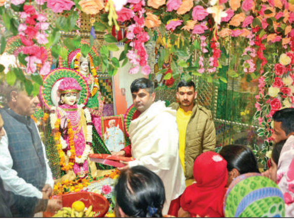
Devotees paying obeisance at Bawa Lal Mandir, Gandhi Nagar, Jammu.