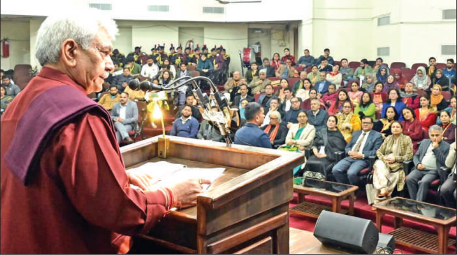
Lt Governor Manoj Sinha addressing inaugural session of 3-day 'J&K Women Science Congress 2024' at University of Jammu on Sunday.

■ STATE TIMES NEWS JAMMU: "I strongly believe the active participation of women in science, technology and research can build India as a global innovation powerhouse. Women-led development in J&K is our prime objective. It is our collective responsibility to achieve this goal," Lieutenant Governor Manoj Sinha said on Sunday while addressing the inaugural session of the 3-day 'J&K Women Science Congress 2024' at University of Jammu. The Lt Governor commended the unique initiative by University of Jammu and J&K Science, Technology and Innovation Council for trans-forming the leadership trajectory for women in science, technology and innovation. He highlighted the consistent efforts of the UT Administration to bridge the gender gap at all levels of Science, Technology, Engineering and Mathematics (STEM) disciplines in J&K. "Today, I am