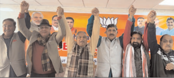
BJP leaders at convention of BJP Professional Cell, Senior Citizen Cell in Jammu.

He explained that how exactly Vajpayee-led government had taken the country forward on development front but then 10 years of Congress led government