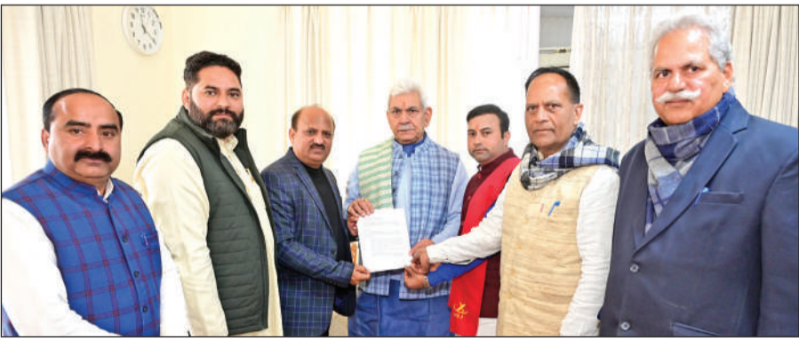
Delegation of ex-MLAs calling on Lieutenant Governor Manoj Sinha.