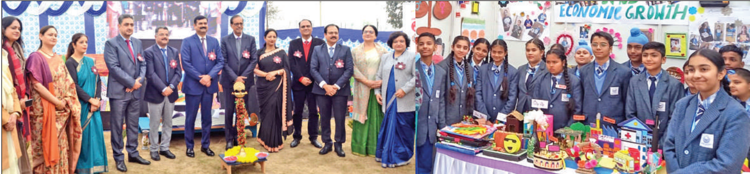
JSS Jammu faculty and other dignitaries at lamp lighting ceremony and students displaying science models.