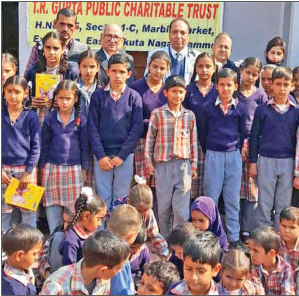
Members of T R Gupta Trust with Teachers & Student of a Govt school in Rajouri.