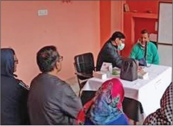
Doctor examining a patient during the camp.