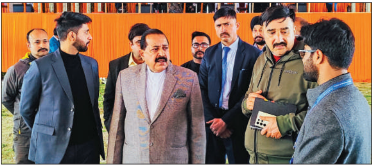
Union Minister Dr. Jitendra Singh, accompanied by senior officers of Central and UT governments, taking final review of arrangements for PM Modi's programme at M.A. Stadium, Jammu on Monday.

The Minister said people from all over the UT are coming to participate in the event, particularly from ten districts of Jammu region. He informed that the people hailing from far flung districts, including Poonch, Kishtwar and Ramban, who will attend the programme will arrive in the city either tonight, whereas those