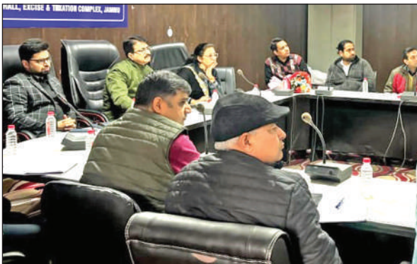
Commissioner STD, Prediman Krishen Bhat and others during the programme.

Speaking on the occasion, the Commissioner said that audit is very important component of taxation system and all the officers should be well versed with accounting