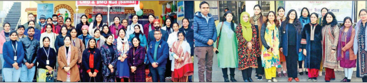
AIIMS Jammu doctors and others at multidisciplinary health camps.

JAMMU: Every year January is celebrated as Cervical Cancer Awareness Month. In a bid to promote women's health and raise awareness about cervical cancer, multiple community outreach activities were conducted to commemorate this initiative. Aligning with the national mission of Cervical Cancer Mukht Bharat, AIIMS Jammu organized two multidisciplinary health camps at CHC Ranghar and PHC Sumb and all the eligible females were offered free cervical cancer screening (PAP Smear). The health camps were organized by AIIMS Jammu in coordination with the Department of Health, Jammu and Kashmir; and the local health authorities with the aim to bridge the gap in healthcare access and offer vital services to women who may otherwise not have the