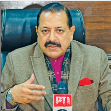
Union Minister Dr. Jitendra Singh briefing the media after the presentation of Interim Budget in Parliament on Thursday.

NEW DELHI: Union Minister Dr Jitendra Singh on Thursday said the Interim Budget 2024-25 reflects the emphasis on Innovation and StartUps to achieve the goal of "Viksit Bharat @2047". The Minister referred to the Interim Budget proposing a corpus of Rs One Lakh Crore to boost innovation and private investment in sunrise technologies. As the Union Finance Minister said, "This will mark a golden era for our tech savvy youth," he said, adding, "it will encourage programmes that combine the powers of our youth and technology." The Union Minister was speaking with the media soon after the presentation of the Interim Budget in the Parliament. "A corpus of Rs 1 lakh crore announced in the Interim Union Budget to promote Innovation and StartUps coupled with a new scheme for Deep Tech StartUps in Defence and an exclusive