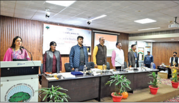
Dignitaries during the event at CUJ.

■ STATE TIMES NEWS JAMMU: Central University of Jammu (CUJ) commemorated Sankalp Divas at Brig. Rajinder singh Auditorium on Wednesday. The program aimed at advocating for the return of Pak Occupied Jammu and Kashmir (POJK). A day dedicated to reaffirming our commitment to social causes and community welfare, was marked by enlightening and inspiring events. The program was organized in collaboration with the Office of Dean Students Welfare, Jammu Kashmir Adhyan Kendra, and the Department of National Securities and witnessed a gathering of passionate indi-viduals committed to the cause of reclaiming the region. The events served as a plat-form for discourse and action regarding the critical issue of POJK. Participants were engaged in discussions, pre-sentations, and heartfelt dia-logues emphasizing the importance of reclaiming the territory for the welfare and security of the people of Jammu and Kashmir, UT.