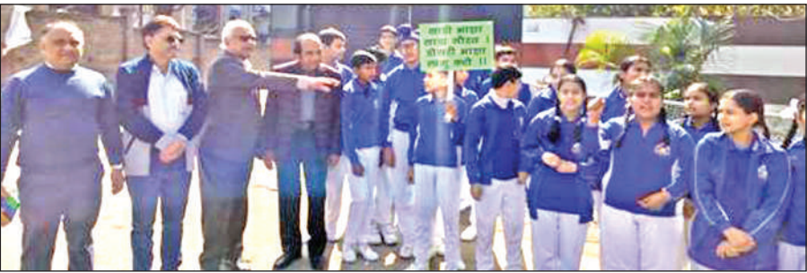
Club members along with students during the event at Chawadi, Jammu.