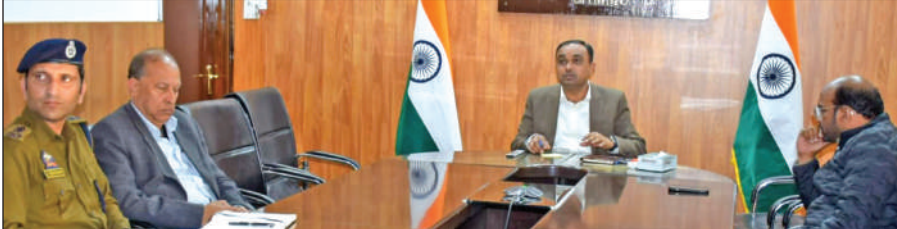
Deputy Commissioners and SSP of Jammu, Samba, Kathua, Udhampur and