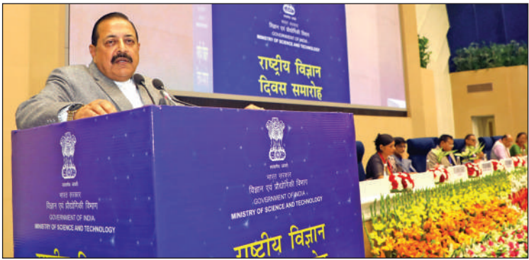
Union Minister Dr. Jitendra Singh addressing the "National Science Day 2024" programme at Vigyan Bhavan, New Delhi on Wednesday.

The Minister expressed the hope that manufacturing of this vector will commence soon in India and proceed with further clinical trials. Stating that the