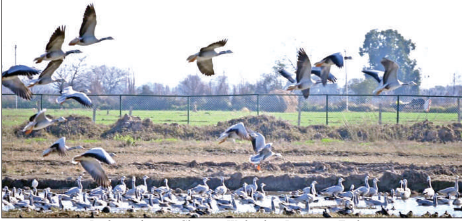
Birds reaching at Gharana Wetland in Jammu on Friday .