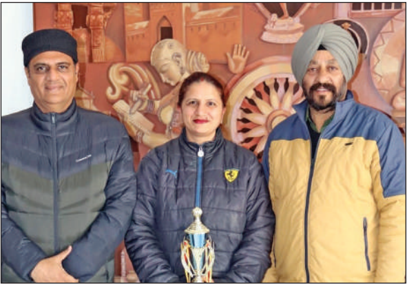
Heritage faculty felicitating winner coach.