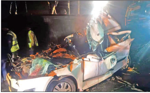
Wreckage of ill-fated car at Jhajjar Kotli.

"Deeply anguished to learn about the loss of lives in a road accident in Udhampur. In this tragic hour my thoughts are with the bereaved family. Praying for the speedy recovery of the injured. District Administration is providing all possible assistance to those affected," the Lt Governor said.