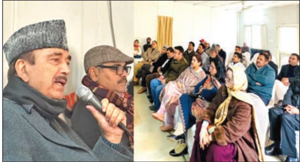
DPAP Chairman Ghulam Nabi Azad chairing a meeting of state and province office bearers of party in Jammu on Sunday.

half year, since the formation of the DPAP, the cadre remained steadfast in seeking redress all of public issues