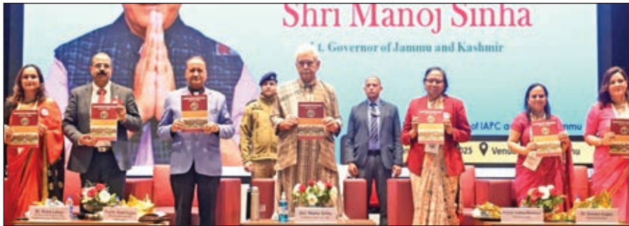
LG Manoj Sinha during the inaugural ceremony of 32nd International Conference of Indian Association of Palliative Care at AIIMS Jammu on Friday.

The Lieutenant Governor asked the private sector to work with the administration to set up Palliative care centres in backward and remote areas.