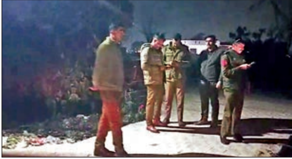
Miran Sahib police personnel gathering evidences at firing site.