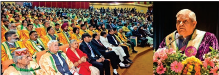
Vice-President of India, Jagdeep Dhankhar addressing at the Convocation Ceremony of Shri Mata Vaishno Devi University on Saturday.