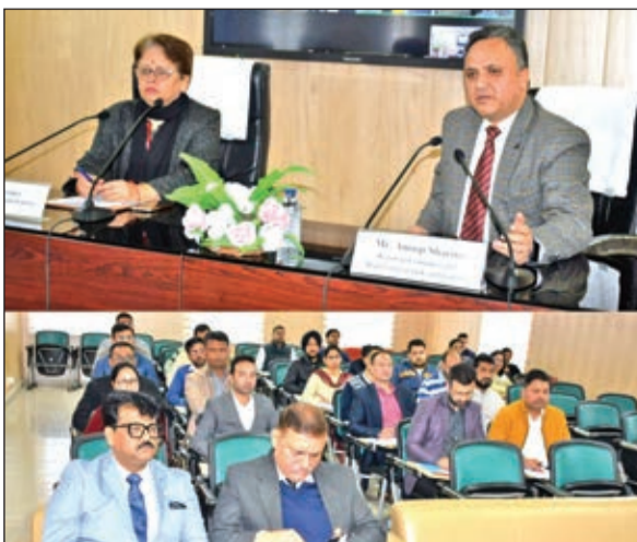
Judicial Officials during the training programme on "Hardware & Software maintenance" in Jammu on Saturday.

at J&K Judicial Academy, Janipur, Jammu.