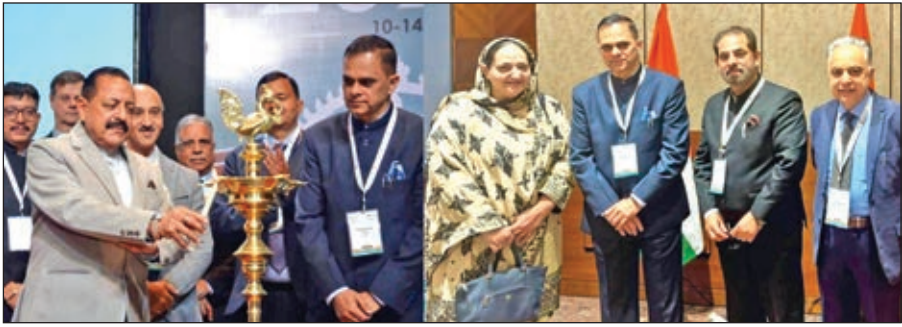
Union Minister, Dr. Jitendra Singh lighting ceremonial lamp at a programme.