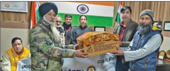
Rotary Club Rajouri Grand members distributing essential winter accessories to the SNCU of GMC Rajouri.