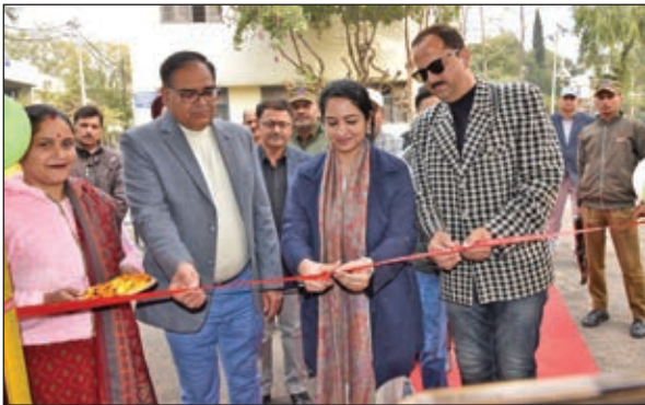
DC Saloni Rai inaugurating "Didi Ki Rasoi" canteen at Government Degree College Boys Udhampur.

This initiative serves two key objectives: providing a steady source of income for women Self-Help Groups and offering affordable, nutritious meals to college staff, students, visitors and the general public, thereby promoting health and well-being in the district.