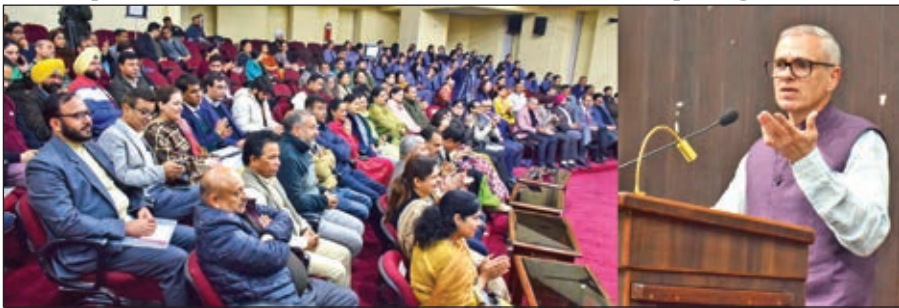
CM Omar Abdullah addressing inaugural session of workshop at Brig Rajinder Singh Auditorium, JU on Thursday.

The workshop is being organized by the Malaviya Mission Teacher Training Center (MMTTC) in collaboration with the Skill Incubation, Innovation, Entrepreneurship