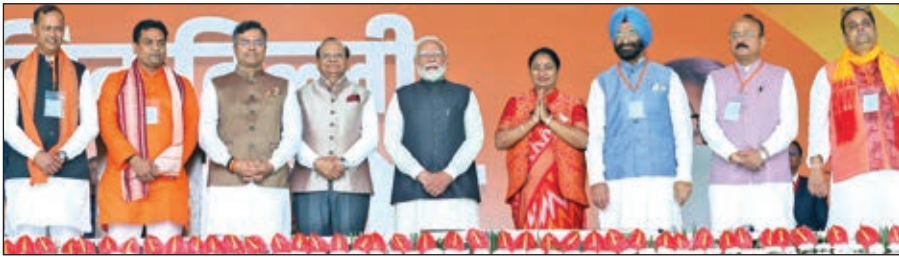
PM Narendra Modi and Delhi LG V K Saxena with newly sworn-in Delhi CM Rekha Gupta and other ministers during oath ceremony at Ramlila Maidan in New Delhi on Thursday.