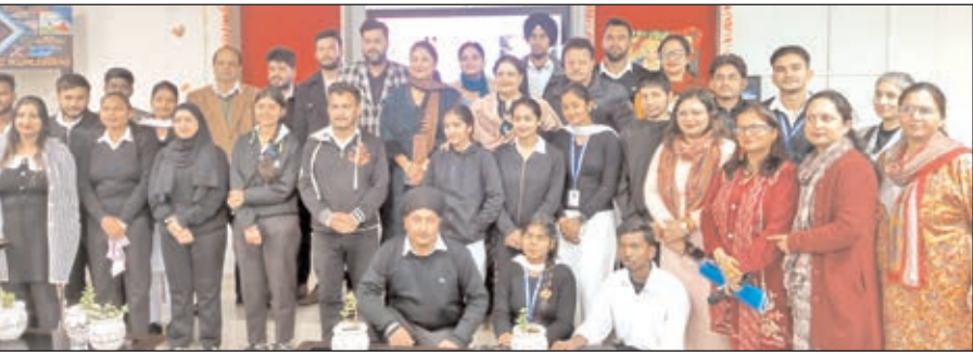
Faculty members along with students during the programme.