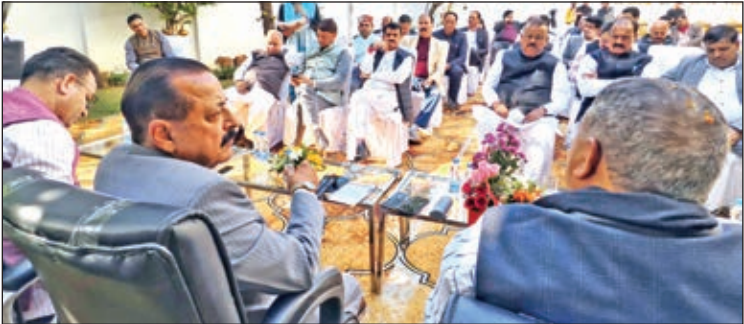
Union Minister Dr. Jitendra Singh chairing meeting of BJP MLAs at his Trikuta Nagar residence.

party's commitment to follow the nationalistic line, raising public-centric issues and bringing pressure on the government to ensure that the governance is transparent and accountable. He urged BJP MLAs to engage constructively in the House and present a united front on matters concerning the welfare of the people of Jammu & Kashmir.