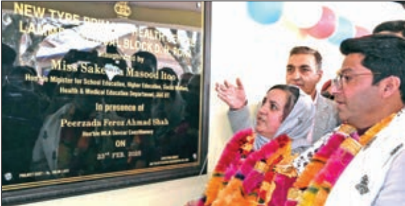
Health Minister Sakeena Itoo inaugurating NTPHC building at Kulgam.

While addressing the gathering on the occasion, the