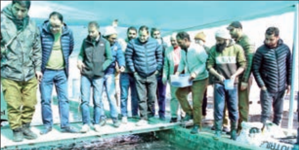
Minister Javed Ahmad Dar visiting Trout Fish Farm Mammer.

The Minister toured the facility, appreciating its eco-friendly practices and state-