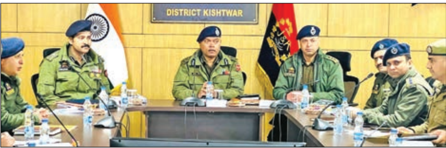
IGP Jammu Zone, Bhim Sen Tuti chairing a meeting at Kishtwar.