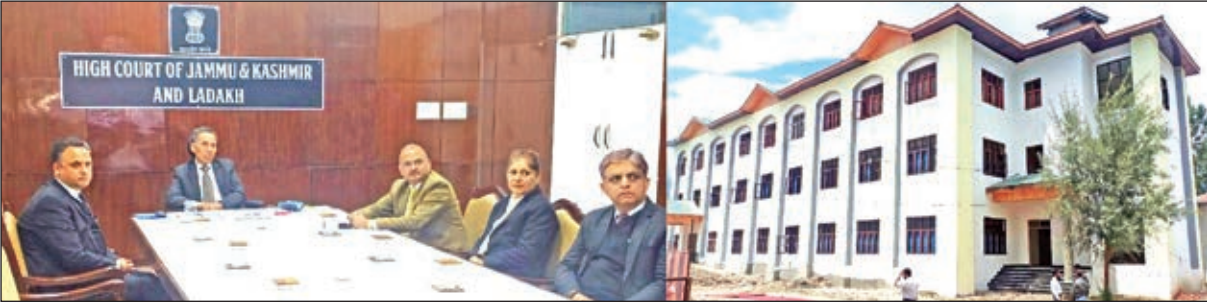
Chief Justice Tashi Rabstan during inauguration of newly constructed Court Building at Kupwara.