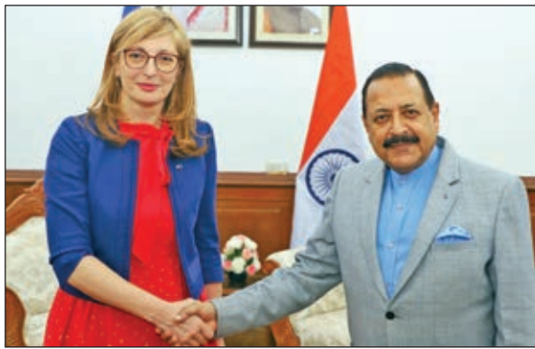
European Union delegation Head, Ekaterina Zaharieva calling on Union Minister Dr Jitendra Singh at New Delhi on Thursday.

During the discussions, Dr. Jitendra highlighted several key areas where India and the EU can collaborate further to drive innovation and sustainable development. These areas